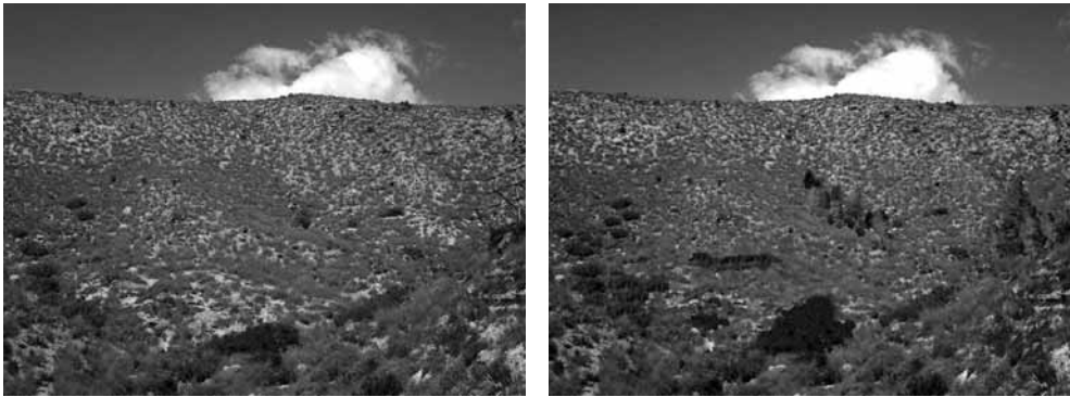
FIGURE 3. Virtual recreation of expected changes after the restoration of an impoverished S. tenacissima steppe in Venta Lanuza, SE Spain. Note the increase in plant cover and the presence of additional woody vegetation, established on favorable sites (ravines, N facing slopes).

(see below). In addition, canopy opening and seedling tending may be needed to ensure P. halepensis recruitment. Finally, herbaceous populations may be reinforced to reach maximum plant cover according to site potential, and minimize interpatch distance and the risk of resource leakage (Tongway and Hindley, 1995; Maestre and Cortina, 2004a).